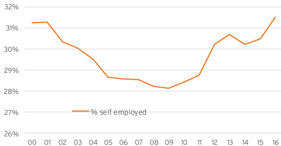
Figure 2. Self-employment rate in Kāpiti, 2000-2016

Source: Infometrics and Statistics New Zealand