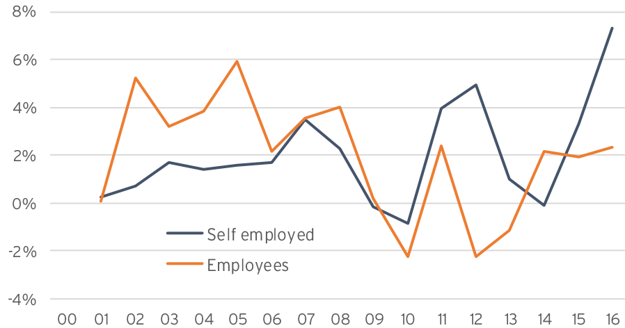
Figure 1. Annual % growth in employment: self-employed vs employees